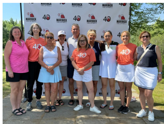
2025 Golf Tournament Organizing Committee